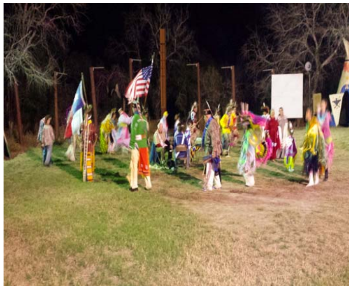
Dancers Circle the Drum During Saturday Nights Pow Wow.